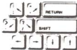
Apple IIe, IIc

Keyboard diagram showing cursor movement for: